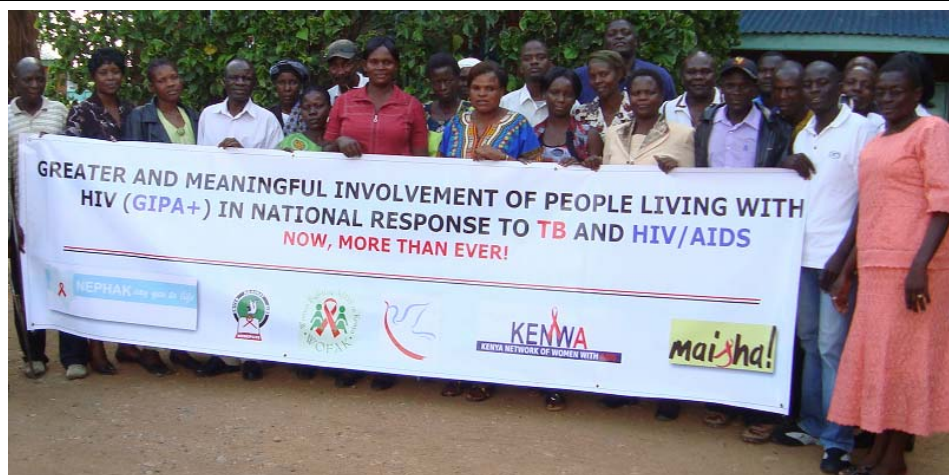
NEPHAK – Nyanza Region members call for GIPA Desk, Now more than Ever

When we thought ARVs Stock-Outs are a thing of the past, reports reaching NEPHAK indicate that the supply of ARVs and other essential drugs are still not predicatble and sustainable. Specifically, Lamu and Nakuru have confirmed stock-outs of ARVs and Septrin respectively. Before reaching out to NASCOP with this information, NEPHAK this week is will undertake a rapid national survey.